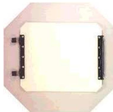
slide plate assembly

Request further informations about the applications of the FELASTEC® - compactor base and slide plate assembly for your plate vibrators!